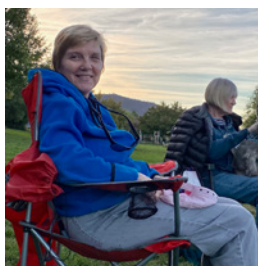
On Oct 12th, the ladies of Fiction Fans met in Railroad Park to discuss Ann Patchett's "The Dutch House."