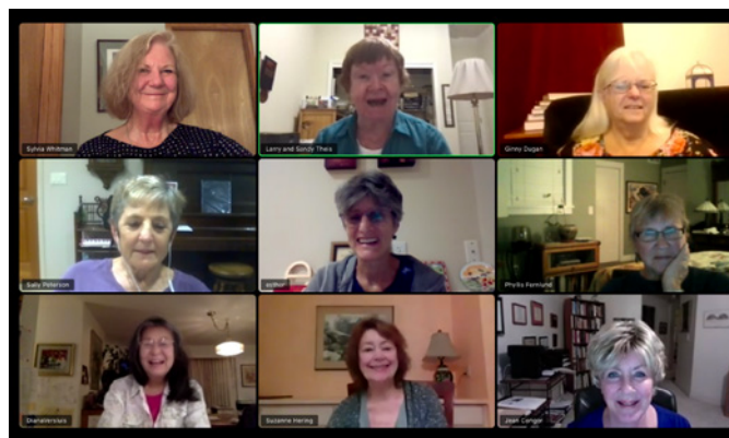
The Mystery Mavens got together on October 8th for a great Zoom discussion of "Gods of Gotham" by Lyndsay Faye.