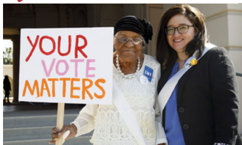
Unnamed image from the homepage of the LWV Oregon website, https://lwvor.org/